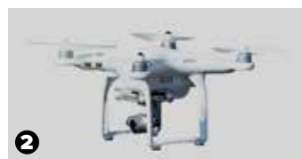
ImageBrew Removes Background